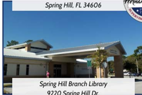
Spring Hill Branch Library 9220 Spring Hill Dr. Spring Hill, FL 34608