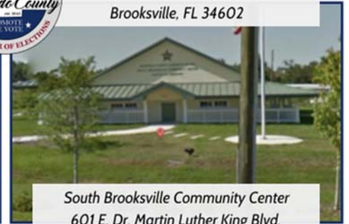
South Brooksville Community Center 601 E. Dr. Martin Luther King Blvd. Brooksville, FL 34601