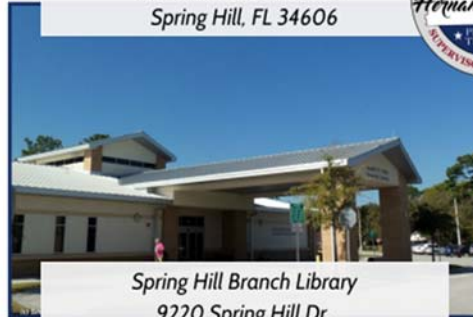
Spring Hill Branch Library 9220 Spring Hill Dr. Spring Hill, FL 34608