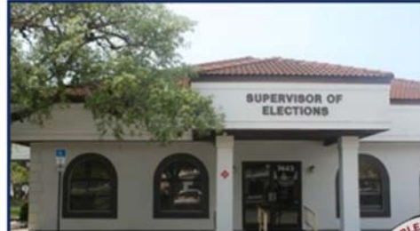
Forest Oaks Supervisor of Elections 7443 Forest Oaks Blvd. Spring Hill, FL 34606