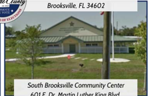
South Brooksville Community Center 601 E. Dr. Martin Luther King Blvd. Brooksville, FL 34601