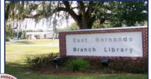
East Hernando Branch Library 6457 Windmere Rd. Brooksville, FL 34602